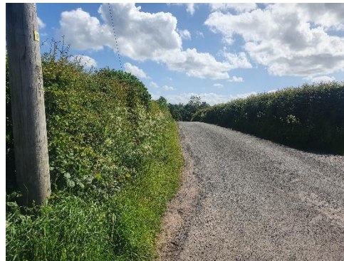
View from farm access track entrance looking south down unclassified road