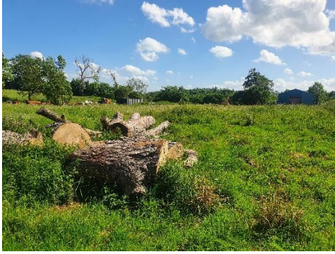
View from farm access track entrance looking south-east over site