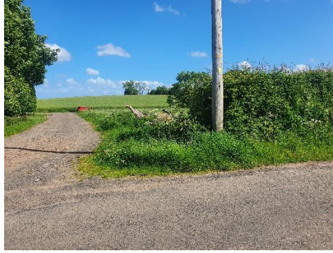
View from unclassified road looking at farm access track entrance